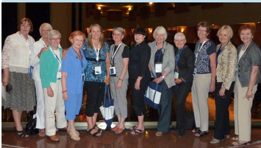
Part of the CFUW Delegation at the 30th Triennial IFUW Conference in Mexico City, Aug 2010.

For more information on CFUW Advocacy: www.cfuw.org